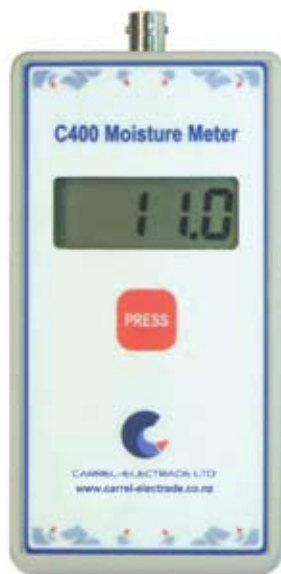
Part No. C400-S/34 474

The C400 meters measure the moisture content of timber using the electrical resistance method specified in the AS/NZS 1080 Standard.