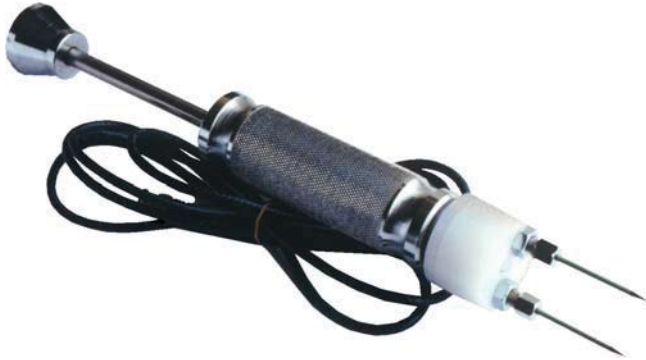
Part No. CH102/34 447