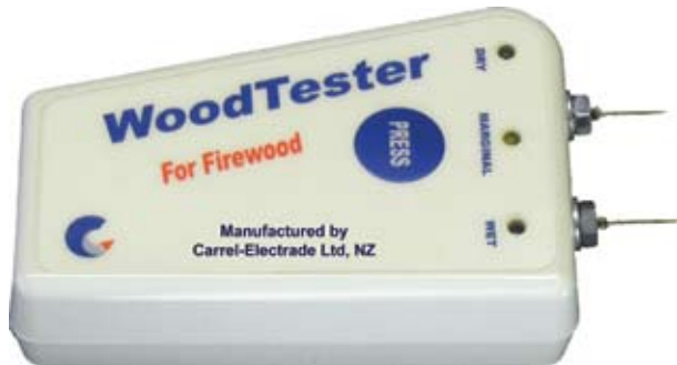
Part No. Wood Tester/34 469

Everyone knows that wet firewood is difficult to light and once alight does not burn cleanly or efficiently. Even wood which appears dry can often still contain large amounts of water.