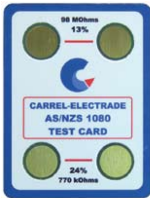
Part No. Test Card/34 455