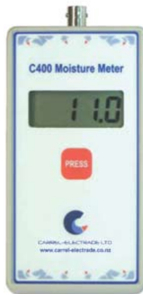
Part No. C400-SR/34 475

The C400-SR timber moisture meter measures the moisture content of timber using the electrical resistance method specified in the AS/NZS 1080 Standard. It can record these readings and release them as and when required. Up to 170 readings can be stored in nonvolatile EEPROM memory. Two versions of this meter are available with stored data down loaded via an RS232 serial port in either MContent ® kiln management format or comma separated variable (CSV) format for importing into spread sheets.