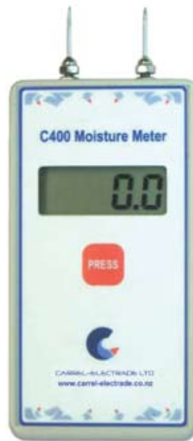
Part No. C400-P/34 472