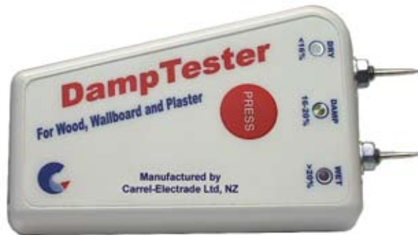
Part No. Damp Tester/34 468

The DampTester is a hand-held moisture tester using the well-proved principle of electrical resistance to determine the presence of moisture in wood and other building materials. Measurements in wood are based on the AS/NZS1080 Standard. The DampTester enables users to rapidly test building framing before cladding is applied thereby avoiding problems at a later stage. It is equally useful for detecting the presence of leaks in completed buildings thus allowing corrective action before permanent damage occurs.