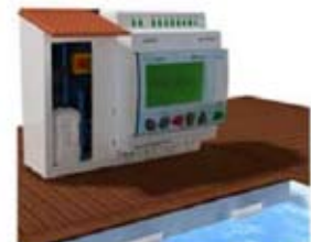
Water pumping system