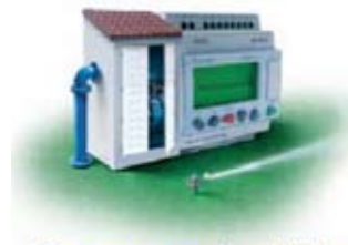
Programmed sprinkling system