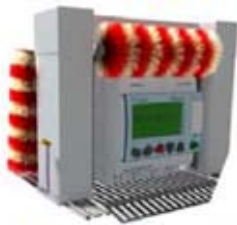
Automatic car and bus wash machine