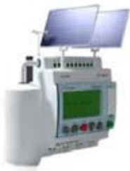
Solar panel system

Compact graphic operator interface with features selected from all Pro-face HMI products.